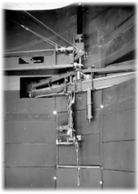
Rotary balance rig in stowed position.

Data for free-flying models are obtained from up to four high-grade monochrome CCD video cameras that provide input into the facility dynamic model data acquisition system. These cameras provide 60-Hz imaging of retroreflective targets that are precisely positioned on the surface of the model relative to any appropriate reference system. Rotary balance force and moment measurements are made with internally mounted six-component strain-gage balances. Multiple surface pressure measurements are made with an electronically scanned pressure (ESP) system. Test section air speed is measured with a pitot-static system. In addition, barometric pressure and test section temperature are also measured. A variety of miscellaneous instruments, including hand held anemometers, force gages, electronic levels, and digital volt meters, are also available.