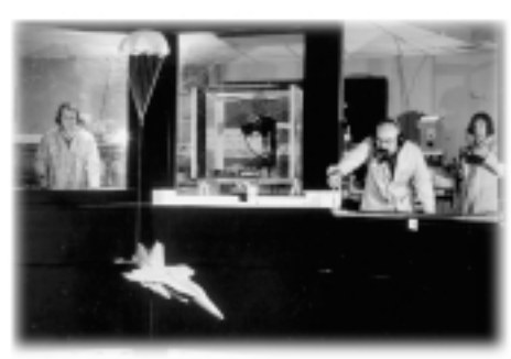
Dynamically scaled free spin model with parachute.

Dynamically scaled, free-flying models are used to investigate large angle, high rate phenomena. Aircraft models can be tested for spinning, tumbling, and other out-of-control situations. Spacecraft models can be used for free-fall and dynamic stability characteristics. Tests images are documented on high-resolution color video. The spin recovery characteristics of aircraft are studied by using remote actuation of the aerodynamic control surfaces of the models. Sizing of emergency spin-recovery