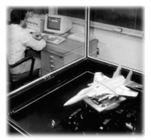
Model on swing rig.

A test rig to determine dynamically scaled model center-of-gravity location and moments of inertia about each axis is available at the facility. Because of the unique requirements of testing dynamically scaled models, direct interaction and consultation with engineers in the facility are required before model construction begins.