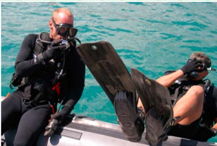
Navy divers prepare to conduct a deepwater ordnance recovery dive in Pyramid Lake.

Pyramid Lake Torpedo and Bombing Range Remediation Project Team's Environmental Restoration Accomplishments: