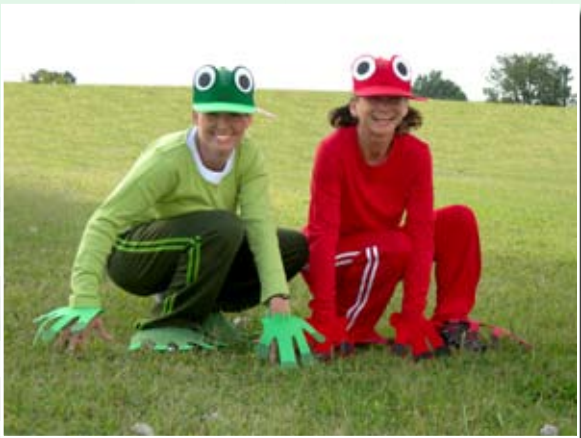
Fanny and Freckles teach stormwater management, pollution prevention, and recycling to kids.

“Fort Campbell has implemented one of the most progressive environmental management systems in the United States military and demonstrated an exemplary commitment to environmental improvements and sustainability.”