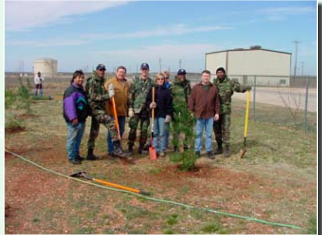
The Dyess Air Force Base Team plants trees outside the Civil Engineering compound in celebration of Arbor Day.