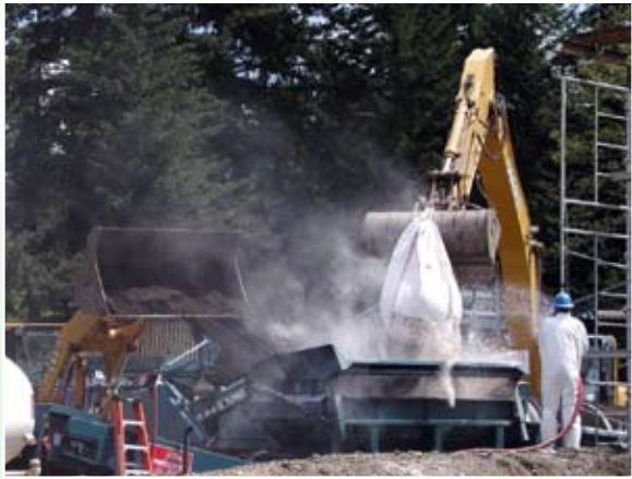
At the former Evergreen Infiltration Range, a phosphate-based stabilizer is added to prevent lead in the soil from leaching during a soil recycling project.

“Fort Lewis has always gone beyond the minimal regulatory requirements – they don’t just do what’s necessary, they do what’s right.”