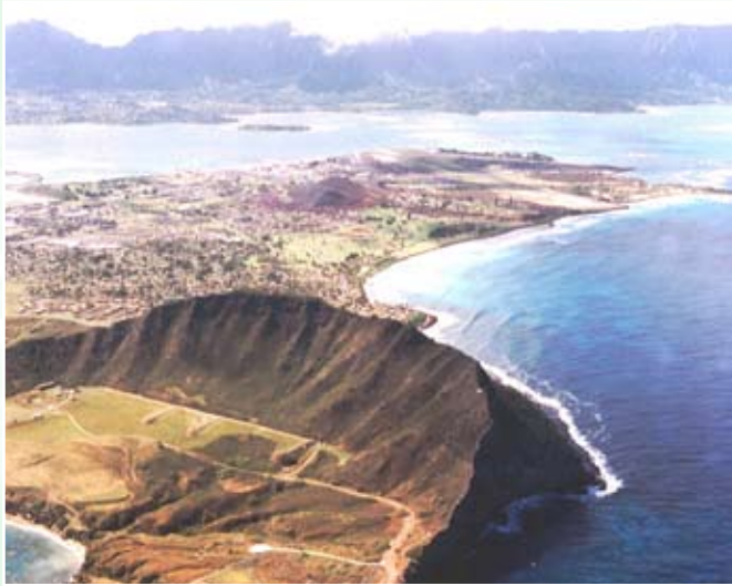
Marine Corps Base Hawaii

Marine Corps Base Hawaii manages the installations and natural resources located on a total of 4,500 acres throughout the island of Oahu, including Camp Smith, Kaneohe Bay, Marine Corps Training Area Bellows, Manana Family Housing Area, Pearl City Warehouse Annex, and Puuloa Range Complex. Through its Integrated Natural Resources Management Plan, the base conservation team works closely with other offices on the installation to manage storm water and erosion, spill response, recycling, and pollution prevention.