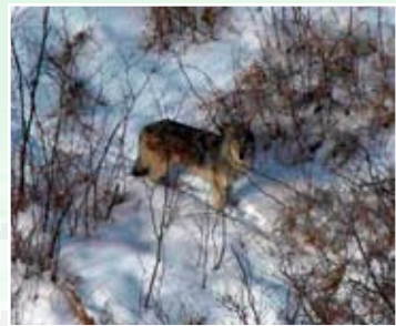
Two packs of wolves are thriving on Camp Ripley, coexisting with troops in training.

The Minnesota Army National Guard Natural Resources Conservation Team is located at Camp Ripley, a 52,758-acre training site, and at Arden Hills Army Training Site, a 1,500-acre training site in central Minnesota. In addition to serving as a military training site, Camp Ripley is the second largest statutory game refuge in the state. The Minnesota Army National Guard Natural Resources Conservation Team manages not only the