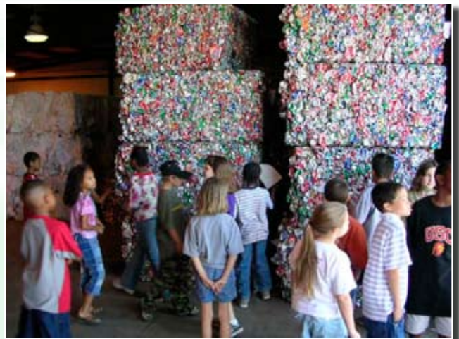
Local school students are given a tour of the Municipal Recycling Facility at Dyess Air Force Base.