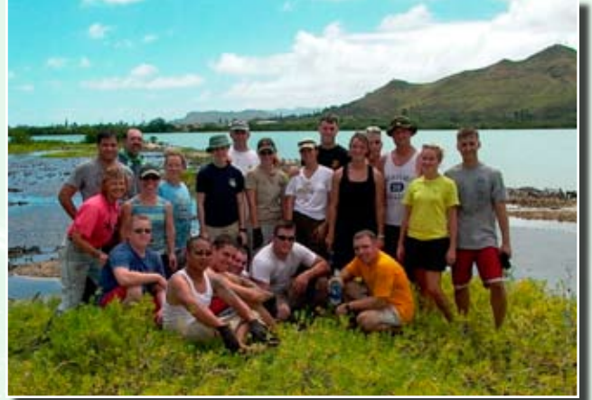
Volunteers helped clear more than 25 acres of invasive mangrove from wetlands.