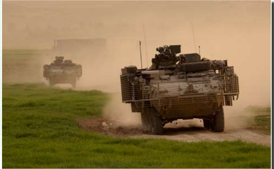
Strykers from Fort Lewis, such as the two shown above, trained for deployment at the Yakima Training Center.

Fort Lewis, home to the Army's first two Stryker brigades, lies on 87,000 acres in northwest Washington. The Yakima Training Center, a 327,000-acre subinstallation of Fort Lewis, is a high quality training area located in the desert of central Washington. Under the Defense Environmental Restoration Program, Fort Lewis restores those areas of the installation that have been impacted by past defense activities, in cooperation with state agencies and the U.S. Environmental Protection Agency.