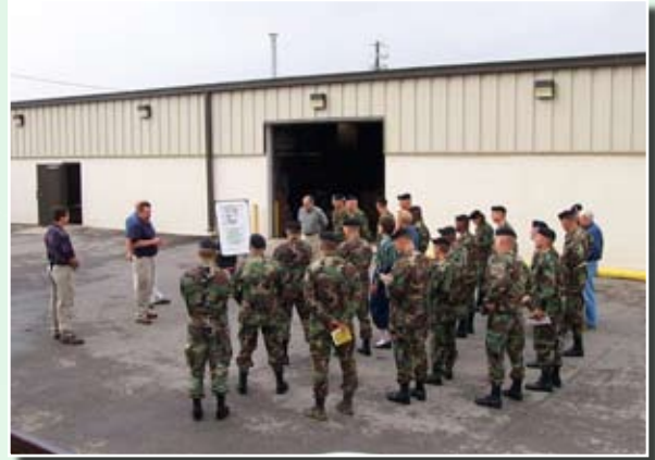
Soldiers tour the Pollution Prevention Operation Center after receiving Environmental Management Systems training. The Pollution Prevention Operation Center conducts 20 two-hour facility tours for units, commanders, students, and civilians every year.

Fort Campbell, a 105,068-acre installation located on the border between Hopkinsville, Kentucky, and Clarksville, Tennessee, supports readiness and mission execution of its expeditionary forces, including the 101st Airborne Division, the 5th Special Forces Group, the 160th Special Operations Aviation Regiment, and the 86th Combat Support Hospital. Fort Campbell's environmental program focuses on meeting the installation's environmental challenges that support soldier readiness, while meeting or exceeding all regulatory requirements.