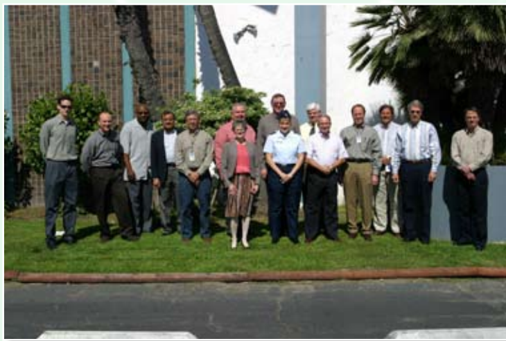
The C-17 Integrated Product Team consists of members from across the country.