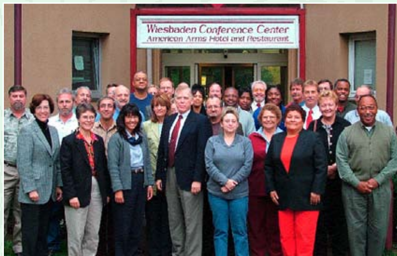
The Defense Logistics Agency Environmental Management Systems Team provides training in Germany.