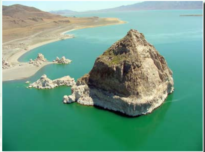
Pyramid Lake Paiute Tribe Reservation

The Pyramid Lake Paiute Tribe Reservation, located in the Great Basin area of Nevada, is home to the Northern Paiute Tribe and Pyramid Lake. Between 1944 and 1946, the Navy leased a portion of the property, known as the Pyramid Lake Torpedo and Bombing Range, from the tribe for military training. As part of ongoing efforts to restore properties formerly owned, leased, possessed or used by the military, the Department of Defense commissioned the Army Corps of Engineers to investigate and remediate any possible hazards remaining from the former training activities at the lake. Sacramento District worked in partnership with the Paiute Tribe, the U.S. Navy, and private contractors to restore the property.