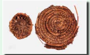
Basketry fragments from Naval Air Weapons Station China Lake South Range.

Naval Air Weapons Station China Lake spans 1.1 million acres in the remote high-altitude desert of east-central California. A wide variety of terrain, ecosystems, and climates makes China Lake ideal for research, development, testing, and evaluation of air-launched weapons systems. China Lake is also home to many important cultural resources, including ancient trails, petroglyphs, nut harvesting camps, former village sites, and hunting artifacts. One of the installation's ancient sacred sites, Coso Hot Springs, is still in use today by Native Americans. China Lake's cultural resources program uses an Integrated Cultural Resources Management Plan to ensure that cultural resources are considered in all facility and mission planning, including the reuse and preservation of historic buildings and maintenance of archaeological artifacts.