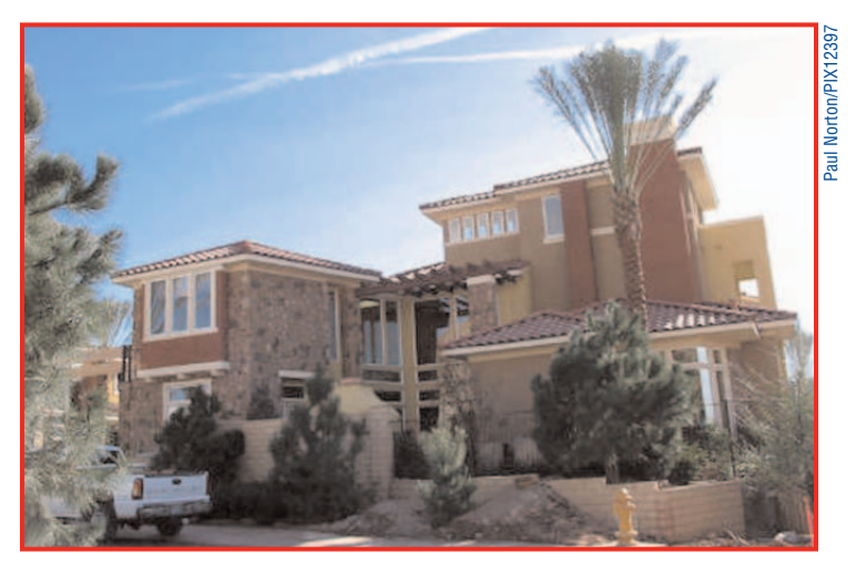
This New American Home built by Building America partner IBACOS (Integrated Building and Construction Solutions) in Las Vegas, Nevada, was designed with energy efficiency as well as comfort in mind.

In addition to increasing energy efficiency, ongoing research focuses on integrating onsite power systems, including renewable energy technologies. Onsite systems can produce as much energy as the building uses, resulting in zero net energy use. All these research activities enhance the nation's energy security by allowing us to use our domestic resources more wisely.