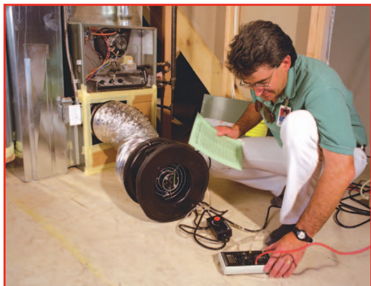
Building America researchers analyze the whole-house energy performance of newly constructed homes by conducting different types of field tests. In this photo, a Building America staff member performs a duct blaster test to measure the impact of duct leakage on whole-house performance.

The Building America approach has been used in the design of more than 25,000 houses in 34 states. And full-scale communities are already under way in 19 states. In these high-performance, energyefficient homes and communities, Building America partners are showing that homes can be durable, high-quality, and comfortable while requiring much less energy.