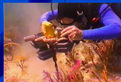
AOML Diver drilling anchor points

ers, and in-situ deployment and recovery of PMEL instruments as required. A PMEL diver also participated in tagging of Stellar Sea Lions in the Aleutian Islands with the Alaska Fish and Wildlife Department.