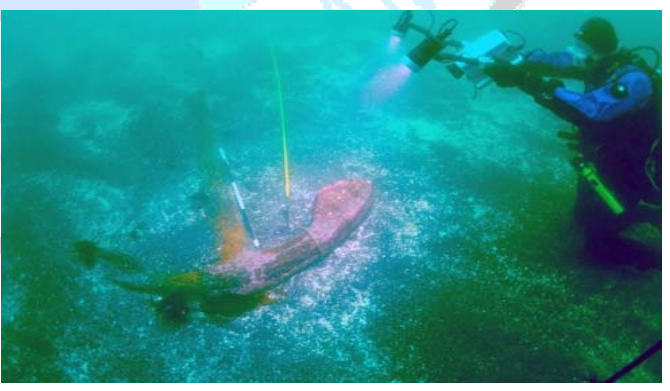
NOS diver surveying anchor from wreck of the Kad'Yak

Stellwagen Bank NMS divers in the northeast continued documentation of the wrecked coal schooner Paul Palmer, and implemented and documented a new autonomous underwater vehicle in a joint project with the Naval Undersea Warfare Center. Thunder Bay NMS divers in the Great Lakes conducted fish surveys and documented historic shipwrecks. In the Gulf of Mexico, Flower Garden Banks NMS divers supported many