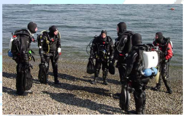
Draeger Semi-Closed Circuit Rebreather training, Seattle

Divers from the NOAA Ships RAINIER, RUDE and THOMAS JEFFERSON supported hydrographic survey operations by tide gage, tide station maintenance and item investigations evaluating hazards to navigation in the approaches to Tampico and Altamira, Mexico; Flower Gardens NMS; Quicks Hole and Edgartown Harbor, MA; Chesapeake Bay; Narragansett Bay, RI; and Long Island Sound, NY. NOAA Ship RUDE divers also assisted the USCG on several recovery operations in the Northeast to clear a channel and recover sunken buoys. And finally, NOAA Ship FAIRWEATHER divers began operations in August (the first operations in 15 years) and assisted in surveying the newly acquired NOAA shore side facility in Ketchikan, AK.