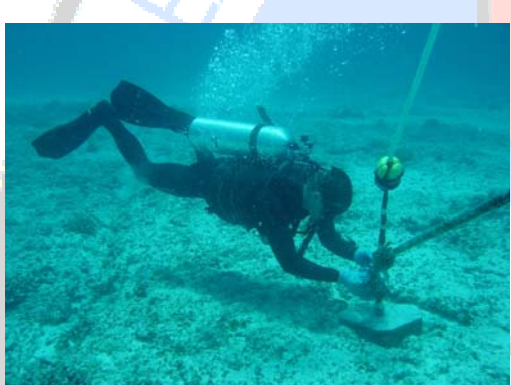
CREI diver switching out an SST buoy

During FY '04, NMFS diving was primarily directed at surveys of fish and habitat. Reef ecosystems received the most attention with work being conducted by the Panama City, Beaufort,