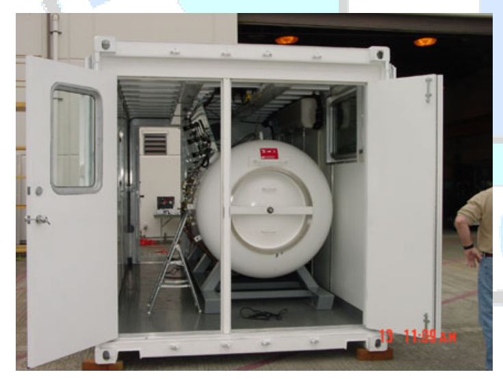
NDC's New Containerized Hyperbaric Chamber System