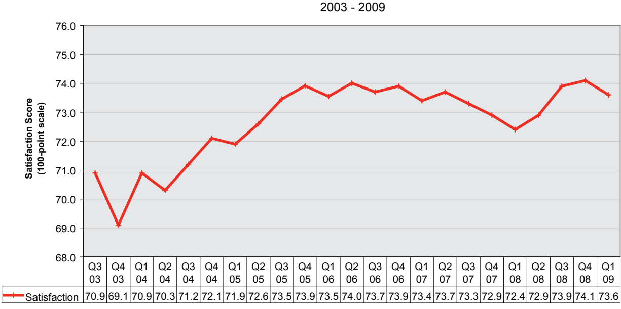
ACSI E-Gov Index Quarterly Trend Line

The chart below shows the trend in citizen satisfaction with government websites from 3rd quarter 2003 (when the first E-Gov Index was published) through 1^{\rm st} quarter 2009. This quarter marks the first decline for the aggregate e-government score in a year. There are 107 sites included in the Index this quarter.