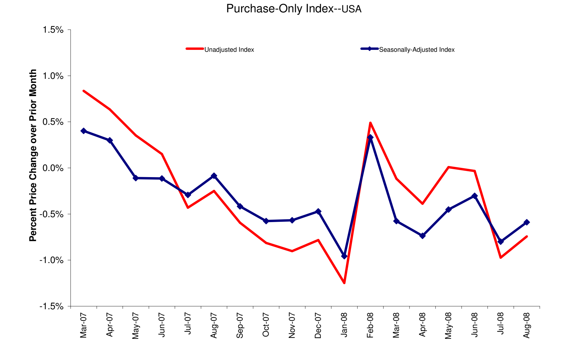
Figure 1: Seasonally-Adjusted and Unadjusted Monthly Appreciation Rates