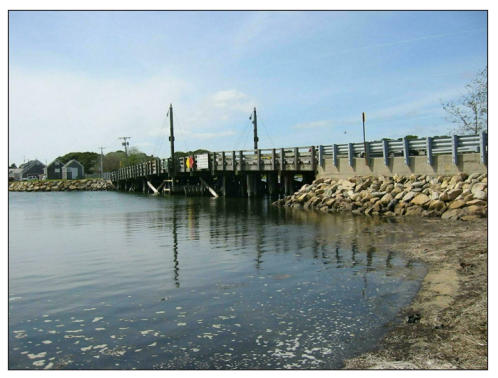
This wooden drawbridge in Chatham is one of a very few such structures still in existence in the nation and is unique in Massachusetts.

The existing bridge is described as a picturesque element in a coastal setting on Cape Cod. The timber drawbridge carries pedestrians, cyclists, and motor vehicles along Bridge Street over the Mitchell River. Initially, the SHPO and MassDOT agreed that because it is