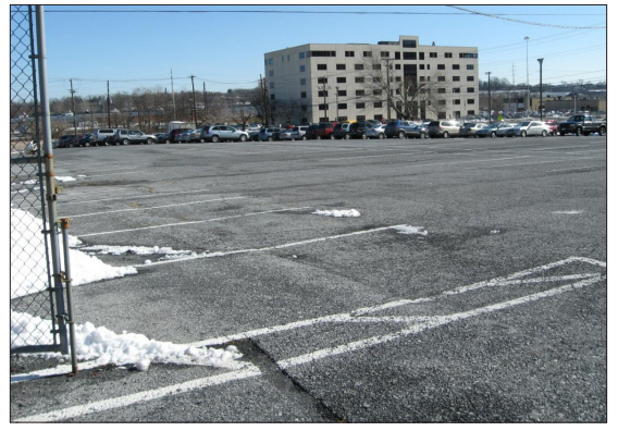
A long and complex process resulted in this parking area being selected as the best alternative site for a new courthouse.

GSA's site selection criteria noted prospective sites must be within the Harrisburg city limits, in compliance with 28 U.S.C. § 118(b), Executive Order 12072 Federal