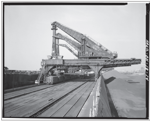
Massive Hulett Ore Unloaders are contributing elements to the historic Pennsylvania Railway Ore Dock.

Controversy regarding the expansion of the CBT and its effects on the Ore Dock has been ongoing since 1997.