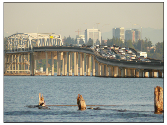
A portion of Evergreen Point Bridge viewed from the perspective of Lake Washington

FHWA and WSDOT initiated Section 106 consultation with the Washington State Historic Preservation Officer (SHPO) on the I-5 to Medina project in 2009. The ACHP became involved in July 2010. The ACHP's decision to participate was based on the large number of historic properties potentially affected, the project's complexity, and substantial public interest. On December 8, 2010, the ACHP participated in a Section 106 consultation in Seattle. The purpose was to provide consulting parties an opportunity to discuss FHWA's determination of