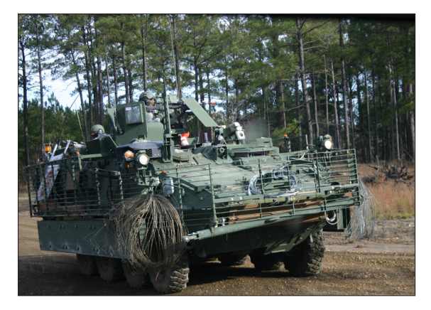
A Stryker vehicle from the 56th Stryker Bridgade Combat Team, Pennsylvania National Guard, moves out to conduct joint operations during JRTC rotation 09-02 at Fort Polk, La.

In 2008, the ACHP received a letter from the Pennsylvania State Historic Preservation Officer (SHPO) requesting agency participation in the ongoing consultation for the 56th Brigade's transformation. The SHPO was concerned about the planned disposition of state-owned historic armories in anticipation of the construction of new readiness centers, as identified in the PAARNG's NEPA documentation. The PAARNG indicated that the disposal of the armories was related to a separate modernization initiative launched by the Commonwealth itself and was not related to the SBCT transformation. The SHPO's opinion was that the disposition of the armories was an undertaking for purposes of Section 106 because it was identified in