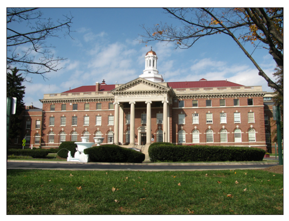
Walter Reed Army Medical Center's Building 1 will be part of the District of Columbia's land use redevelopment plan.

The Department of the Army began in 2005 to examine possible methods of disposing of the 113-acre campus. In spring 2009, 62.5 acres of the campus were declared surplus which led to the creation of a Local Redevelopment Authority (LRA) administered through the District of Columbia's Office of the Deputy Mayor for Planning and Economic Development. The purpose