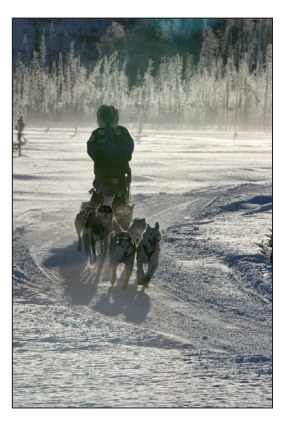
Martin Buser, four time Iditarod champion, shows the dog mushing activity and trail conditions.

STB has developed the Cultural Resources Work Plan: Proposed Port MacKenzie Rail Extensions Project, Port MacKenzie to Willow, Alaska STB Finance Docket No. 35095 for inventory of potentially-eligible properties prior to construction, and has conducted potentiallyeligible properties inventories for a range of alternatives. Based on the literature, archival, and Alaska Heritage Resources Survey review, it was determined that 42 previously documented cultural resources were located within one mile of the project alternatives, including