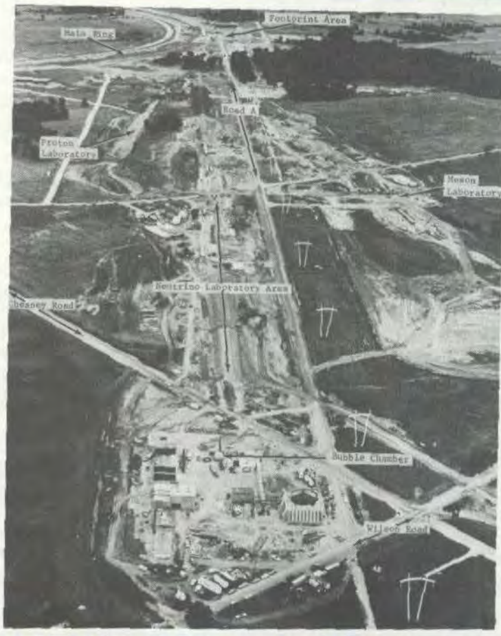
... Aerial view of NAL experimental areas under construction...