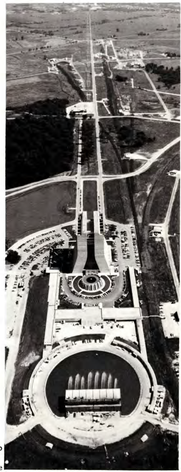
..Recent aerial photo by Tony Frelocelearly shows the three external experimental lines at Fermilab...

Septum Magnet - A special magnet fixed so that one side is shaved away and the magnetic field goes to edge of the device. A septum magnet can be used to peel off beam just as an apple peeler is used to slice off the skin of an apple.