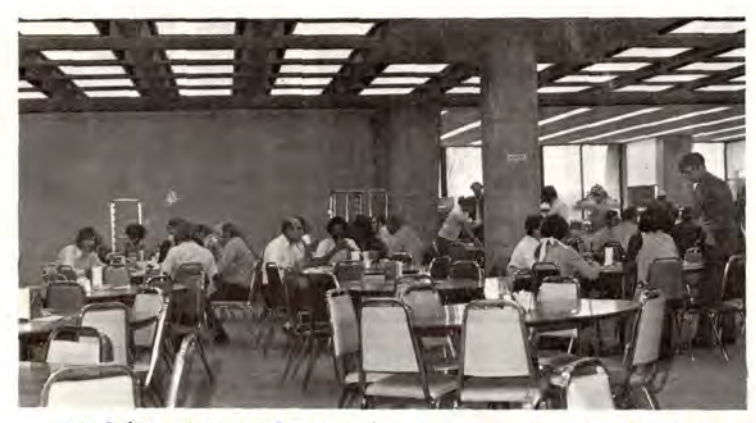
...Looking toward serving area of new Central Laboratory Cafeteria on opening day, November 1st...