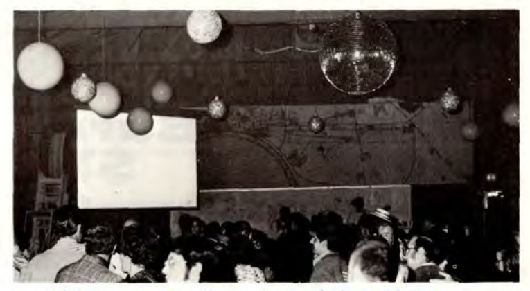
..Village Barn decorated with bubbles, baubles and beads...