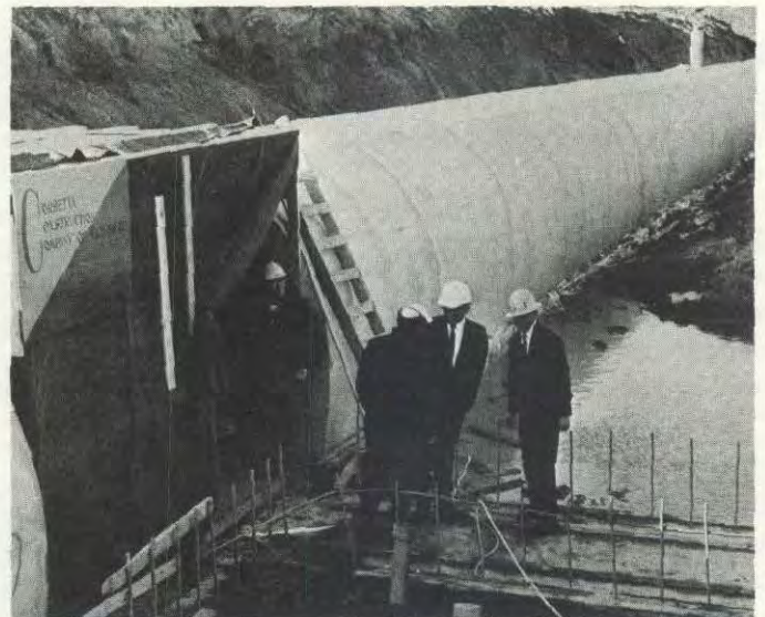
....E. Parke Rohrer, DUSAF's project manager, and RRW congratulate Corbetta workmen on completion of their work on four-mile-in-circumference Main Ring Enclosure....

related to the cooling towers to be located nearby. The four-mile enclosure, along with associated service and access buildings, contains some 36,000 cubic yards of concrete. About 2,750 tons of reinforcing steel also were used in the enclosure. Tunnel excavation alone involved transporting about 960,000 cubic yards of earth. Earth shielding is being used to cover the entire enclosure and the entire tunnel will be covered in the next few weeks.