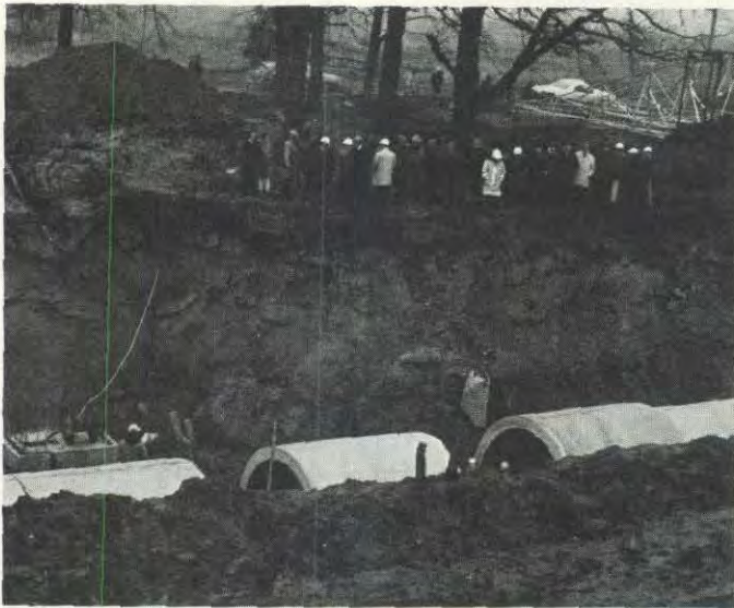
....An overview of the informal ceremony to observe the closing of the Main Accelerator with pre-cast concrete sections....