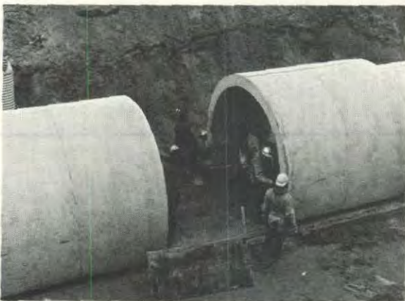
....Corbetta Construction Co. workmen prepare to spread grout to bind final pre-cast enclosure in NAL's Main Ring....

The Main Ring Enclosure consists of 1,790 pre-cast concrete sections. Each section is nine feet high, 10 feet wide, 10 feet long and 10 inches thick. The sections are placed on a poured concrete slab approximately 20 feet below ground. Special vehicles are planned for moving equipment and personnel.