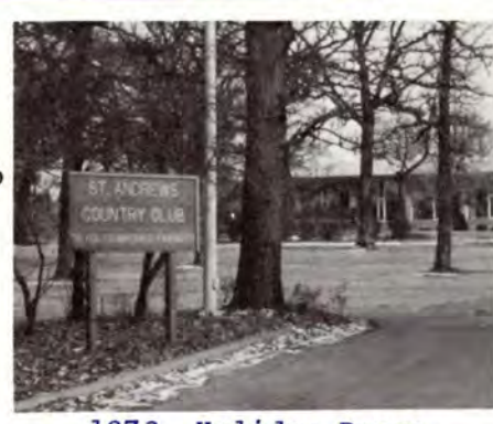
...1973, Holiday Dance for NAL employees at St. Andrews Country Club...

Winter Wonderland, the sixth annual NAL Holiday Dinner Dance, will be held Saturday, December 22, from 6:30 p.m. to 1 a.m. at St. Andrew's Country Club. St. Andrews is located on Rt. 59, just north of North Avenue (Rt. 64) in West Chicago, and now gaily decorated with pine trees and boughs to create a festive holiday atmosphere. All NAL, DUSAF, B & H Janitorial and Advance employees and NAL experimenters and their guests are welcome.