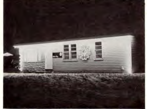
...In 1968, houses in the NAL Village were decorated for holidays...