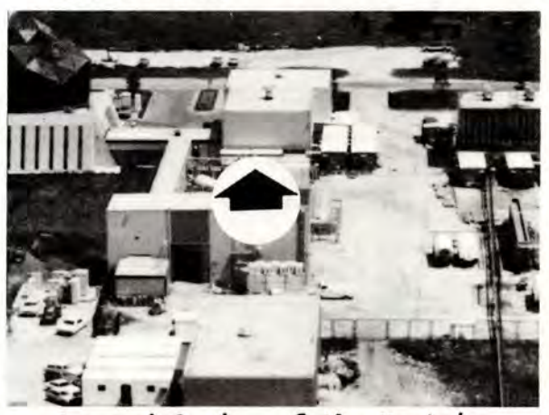
... An aerial view of the Neutrino Area at Fermilab. E-247 located in portable building indicated by arrow ...