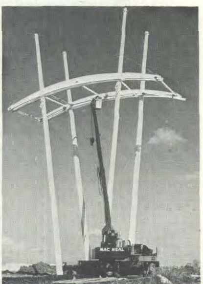
conductors 65 feet above grade level ....

In the case of the Main Accelerator, which is four miles in circumference and 1.24 miles in diameter, direct burial cable is utilized for the distribution system. There will be substations adjacent to each of the 29 service buildings around the Main Ring. At the individual substations, the voltage will be reduced ....Workmen complete from 13.8 Kv to 480/277 volts. This voltage reduction also will be done for each of the other Laboratory components -- Linac, Booster, Beam Transfer, Experimental Facilities.