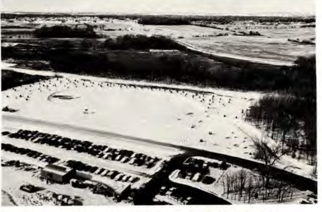
... New pond west of Central Lab...

The solution to a mechanical problem in the operation of the linear and booster accelerators at Fermilab will create a new scenic park-like area west of the Central Laboratory Building. In a few weeks Mother Nature will go to work in the operation of these accelerators. Chilly winter temperatures will refrigerate water used in the accelerator system, presently cooled by towers located in the Central Utility Building (CUB) on the west side of the booster accelerator. By springtime grassy landscaped additions around the new water system will be ready for employees and visitors to enjoy.