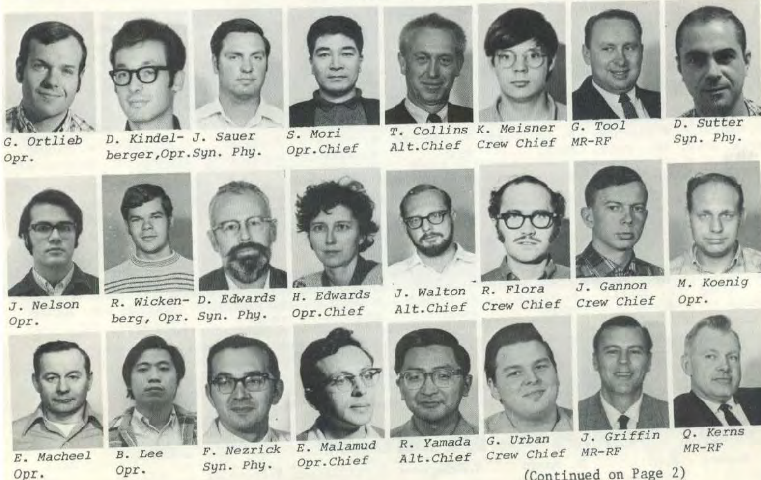
G. Ortlieb Opr.

The achievement of each level of acceleration at NAL is possible only because of the hard work, the dedication, the skill and the experience of all of the people at the Laboratory. Pictured in this issue of THE VILLAGE CRIER are some of those people who served on shifts in the exciting hours when the machine was brought to this new peak energy. (Scope trace courtesy of D. Sutter.)