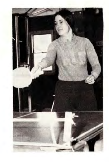
...The looks of summer, at Fermilab...