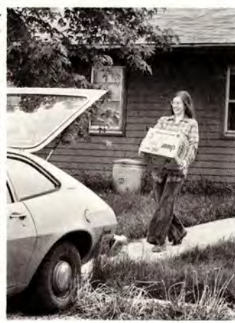
... Fermilab visitors moved last weekend...