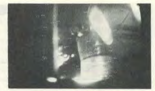
... Vertical line at left is the Hydrogen Jet as seen on screen during successful test run...