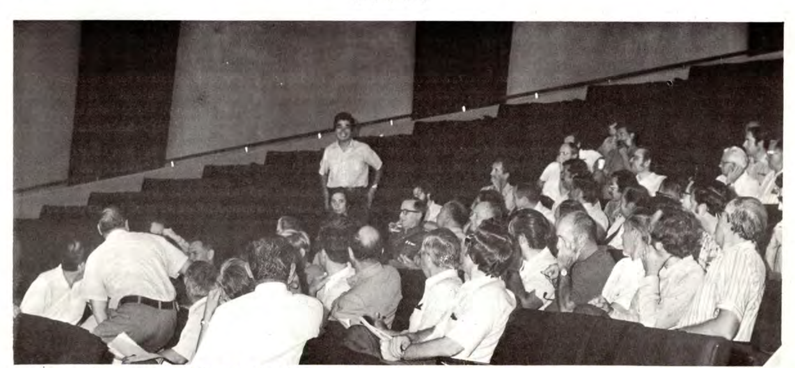
... NAL employees recently met for the monthly Directors meeting held for the first time in the auditorium adjoining the Central Laboratory building. The 900-plus seating capacity of the auditorium, compared to the 100 seats of the Curia where meetings were held previously, now assures comfortable seating for all who attend. The meetings, open to any Laboratory employee, provide a monthly review of NAL activities particularly in the technical area as well as comments by the Director and a question and answer period ...

CHILDREN'S SWIM MEET...Sunday, August 26...2 p.m. Further details in next week's VILLAGE CRIER.