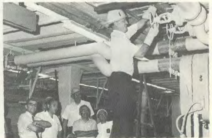
....RRW turns the valve for Central Utility Cooling Pond....