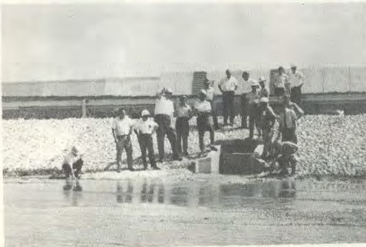
....Water begins to flow into first cooling pond....