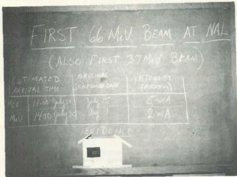
THE LINAC BULLETIN BOARD BRINGS THE NEWS....