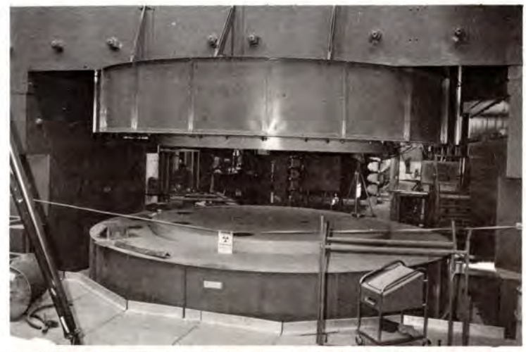
...NAL's Neutrino Section becomes the second generation to prepare the magnet shown above for particle physics experiments...