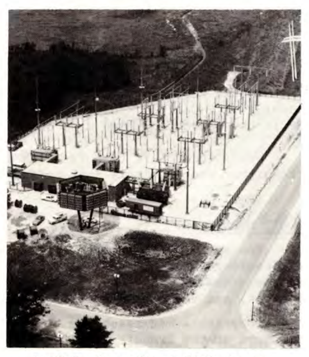
... Aerial view of Fermilab Master Substation...