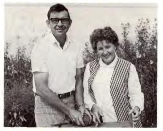
... Foraging in new territory...