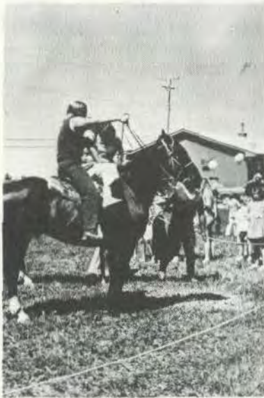
The Riding Club responded to the anticipated requests for a "horseback ride" and brought five horses to the Village for the enjoyment of the children. Club members took many young visitors around the improvised ring during the afternoon....