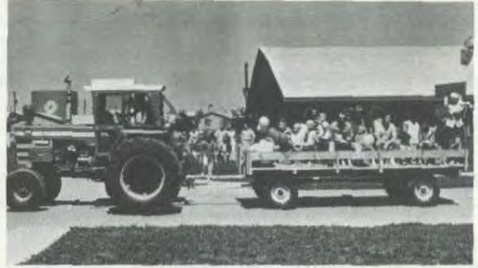
Tractor-haywagon rides were provided by Farm Management, as well as fire engine rides by the Fire Department. More than 1,200 children of all ages rode during the afternoon....