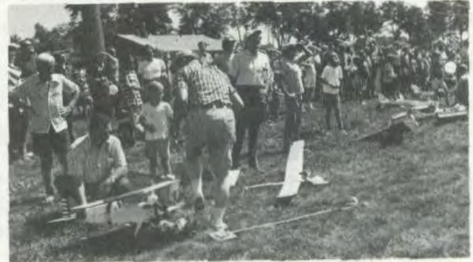
Arranged by Tony Frelø of the NAL Photo Unit, the demonstration included more than 35 models of expert craftsmanship. The aerial antics of the remotely-controlled flying machines brought squeals of delight from the onlookers all afternoon....