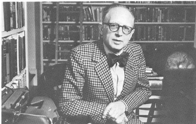
Daniel J. Boorstin