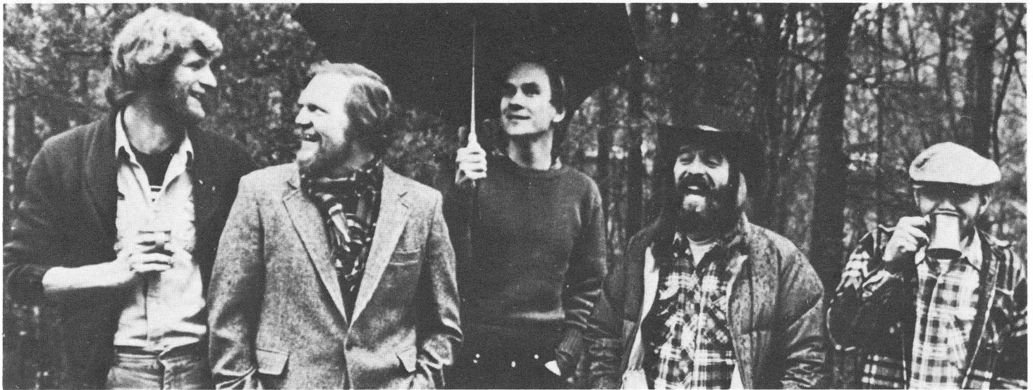
The Red Clay Ramblers appear along with Stan Rogers on August 7, in the Auditorium.