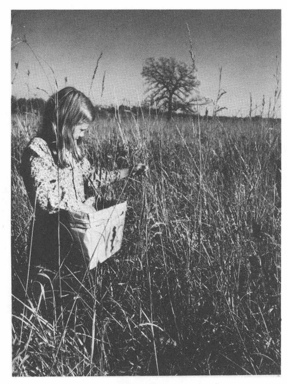
Young volunteer harvests Indian grass.

On Saturday, November 7, from 10 a.m. to 3 p.m. harvesting will take place at the Midlothian/Markham prairies. To reach Midlothian, go south on I-294 to 127th and Cicero. Take Cicero to 147th St. Turn left (east) on 147th. Take 147th to Kedzie, go four blocks south on Kedzie. Meet on the west side of the road between 151st and 159th Streets. A van will depart from Fermilab. It will leave Wilson Hall at 9 a.m. and return about 3 p.m. If you want a ride, call ext. 3353 by Friday, November 6. Rain date is November 8.