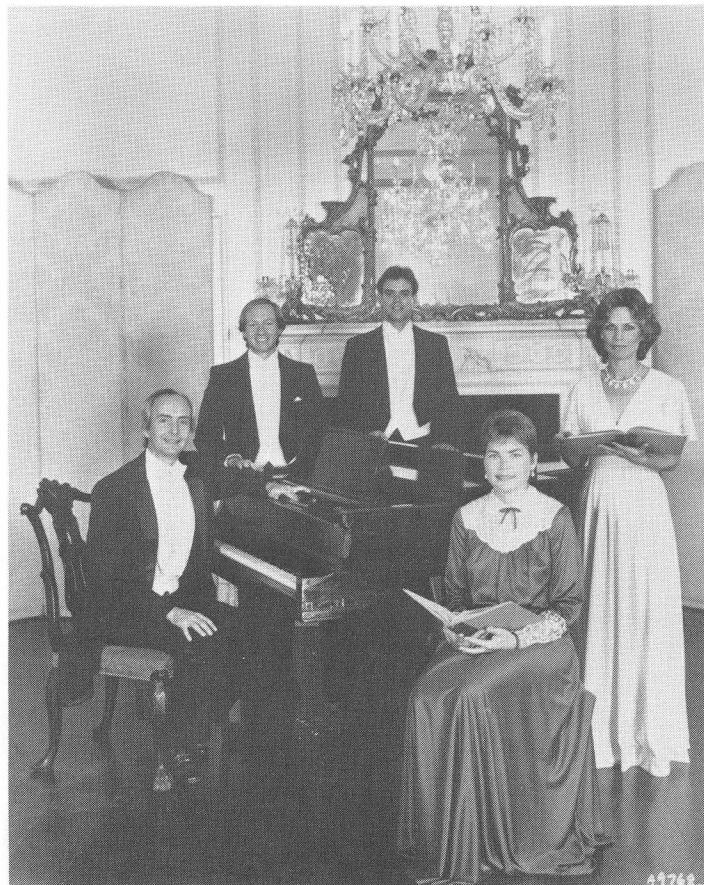
New York Vocal Arts Ensemble