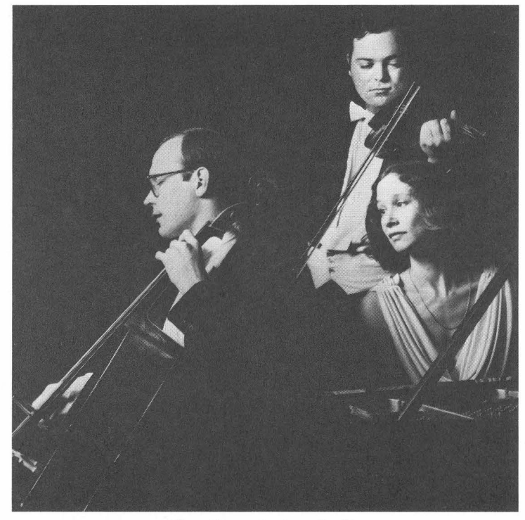
The New Arts Trio

Plan to attend this enjoyable evening of chamber music with the New Arts Trio. Admission is $6, and tickets are available at the Information Desk in the atrium of Wilson Hall, ext. 3353. Phone reservations are held for five days, but due to ticket demand, those reservations not paid for within five working days will be released for sale.