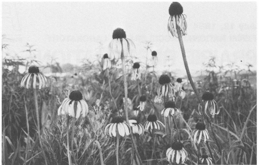
Purple coneflowers grace the prairie in summer with their purple to pink petals and in winter with their black seed heads.

← Prairie dock stalks frequently exceed 6 feet in height. With a bright yellow bloom, prairie dock, a member of the sunflower family, can be used as an indicator for discovering remnant prairies. The roots descend underground for 12 feet.