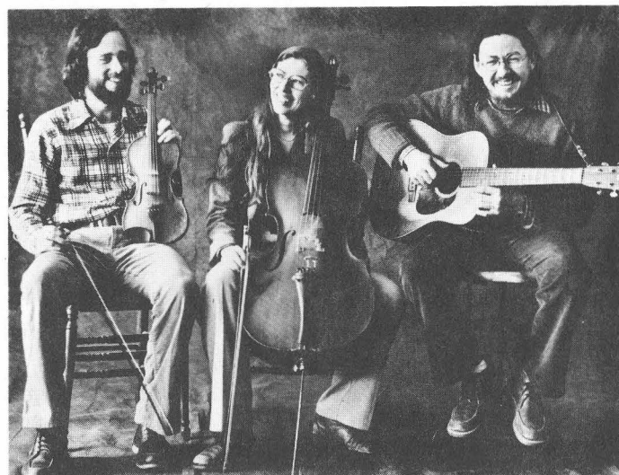
Norman Blake and The Rising Fawn String Ensemble