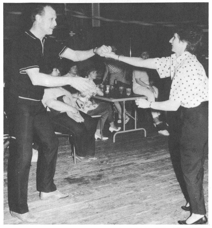
☆ U.S. GOVERNMENT PRINTING OFFICE 1986—641-072/20023