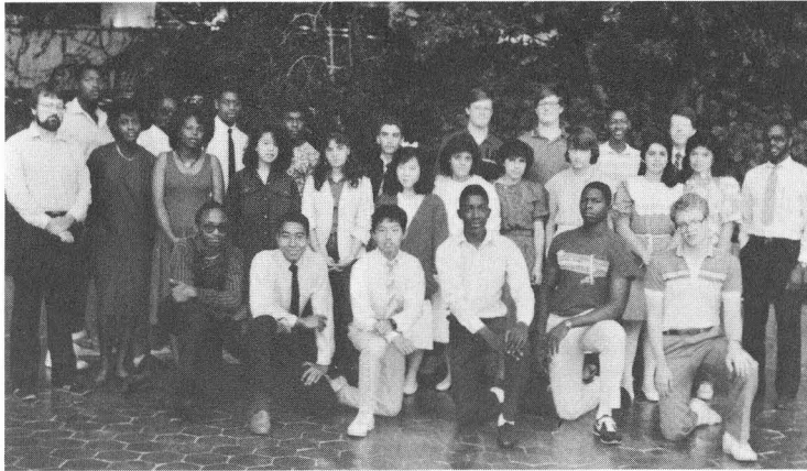
A family portrait of this year's "Target: Science and Engineering" students and their advisors.

"Target: Science and Engineering" (TSE) is once again right on target at Fermilab this summer. This unique internship program, which combines research, hands-on experience, and instruction in physics, is now in its seventh year at the Lab. Twenty-six students chosen from among the best and brightest in their high schools in Chicago and Aurora were enrolled in the 1986 session. For six weeks they were plunged into the world of science - and the technology which supports science - and got a clear picture of what a career in a scientific discipline may be like.