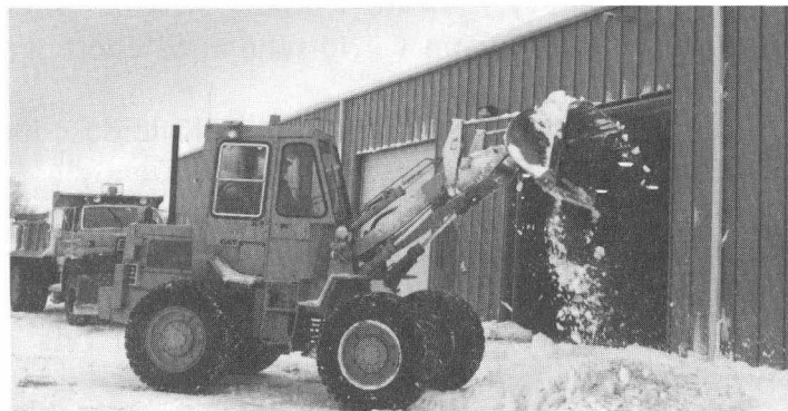
Digging out in front of the new Roads & Grounds Building.

They have one. Fourteen thousand square feet of brand new building divided between heavy-equipment storage for all seasons and office space, R&G's new building is located north of the Site 38 warehouses. Safety is improved, working conditions are improved, repair costs are expected to decline, sand is now pre-loaded onto the spreaders when bad weather is expected, the spreaders are parked inside overnight, and are ready to go next day, and those afore-mentioned 45 minutes are no longer wasted.