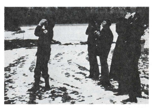
... Bird watchers spot quarry in trees...