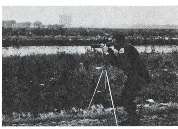
... Dick Hoger, 30-power spotting scope...

The 60 species garnered in the Fermilab area included two Canvasback ducks spotted in the Main Ring at 7:30 a.m. The Canvasbacks are usually seen in Lake Michigan. At the other end of the day three Short-eared Owls were seen at 4 p.m., also at Fermilab. A Budgerigar, or Parakeet, reported