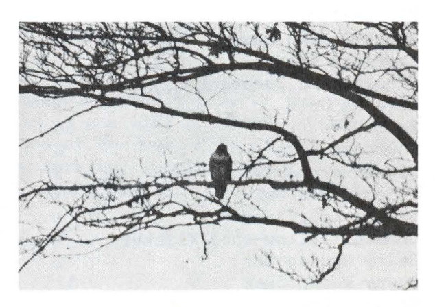
...Upright Red-Tailed Hawk easily spotted...