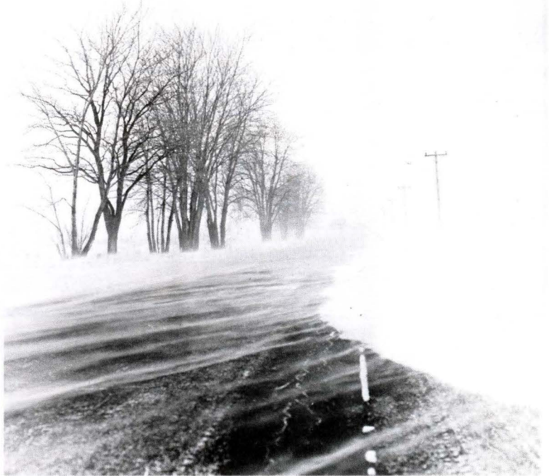
...Snow clogged Road B and other site roads on Thursday, Jan. 26...

FLASH!! As of Sat., Feb. 4, all telephone numbers to the Argonne National Laboratory have been changed. Call the Fermilab switchboard operator for correct information.