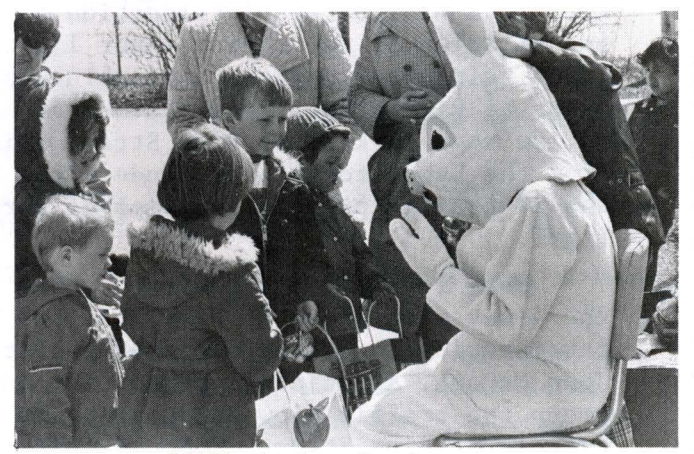
...1977 Easter Party scene...

Kids through age nine are invited to NALREC's 1978 Easter Egg Hunt. The event will be held at 1 p.m. Saturday, Mar. 25, east of the Village tennis courts. In case of inclement weather, the hunt will be held in the Village Barn. Prizes will be awarded to finders of specially marked eggs; the Easter rabbit will greet children. Egg hunters will need to supply their own baskets. Free admission!