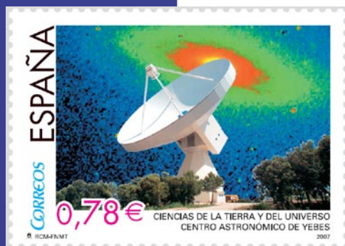
Special issue stamps showing the VLBI antennas at Yebes, Spain (top) and Ny-Ålesund, Norway (below).