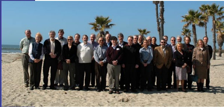
(top) Participants at the GGOS Retreat in Oxnard, CA, USA in February 2007.

The Global Geodetic Observing System (GGOS) project of the International Association of Geodesy (IAG) made further steps in becoming an operational system. A group of about 30 people came together in Oxnard, CA, USA to participate in the GGOS Retreat 2007. The main focus areas of this three-day event (February 19–21) were threefold: (1) reports from the GGOS working groups and GEO (Group on Earth Observations) representatives about their on-going work, (2) discussion of the