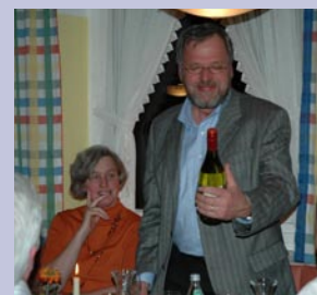
17th Directing Board Meeting 2007