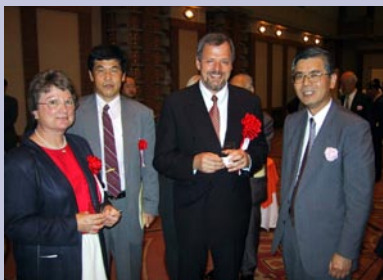
Radio Day 2001