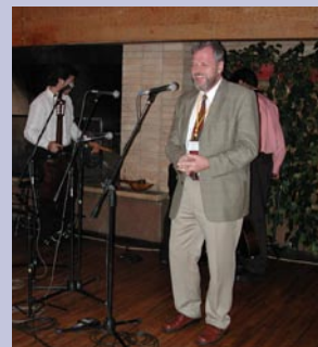
General Meeting Chile 2006