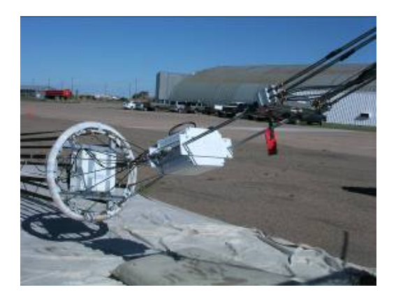
Figure 3 - Flight train layout

The flight line crew lays out a protective ground cloth—the entire length of the flight train and balloon—to prevent ground contact damage to the flight train equipment, parachute, and balloon. The parachute stream is laid out onto the ground cloth and checked (Figure 3).