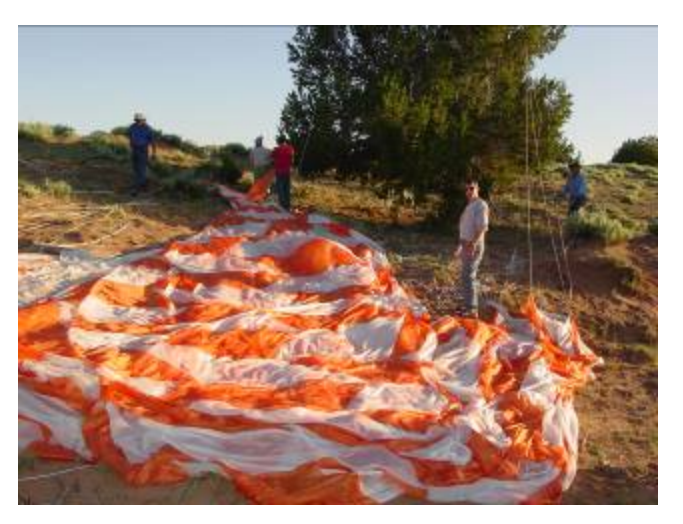
Figure 15 - Parachute recovery

The balloon, parachute, and payload are then recovered.