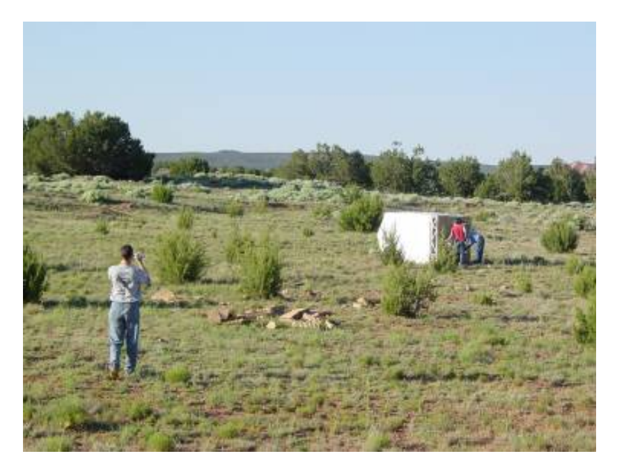
Figure 16 - Payload landing site