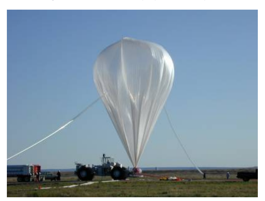
Figure 7 - Balloon being filled with helium