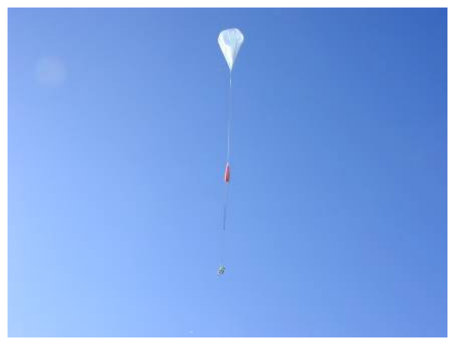
Figure 12 - Balloon ascending

The balloon and its cargo then begin the ascension to float altitude (Figure 12).