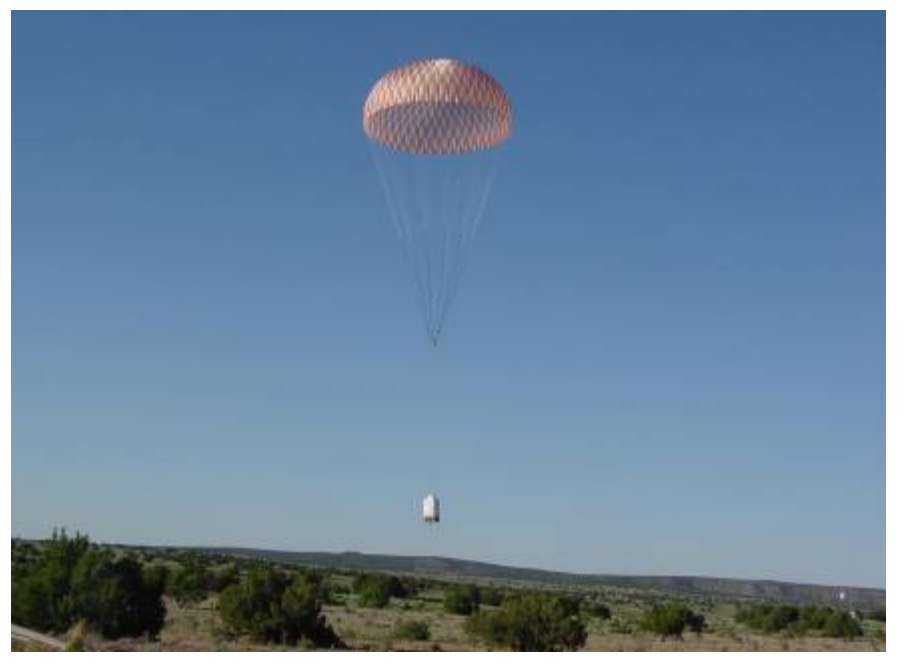
Figure 13 - Payload descent on parachute after flight termination

The payload parachute release system (PPRS) is in line with the flight train and deploys immediately upon command activation, initiated at flight termination. Separated from the parachute and payload, the balloon carcass free-falls to the ground and the payload descends on the parachute (Figure 13).