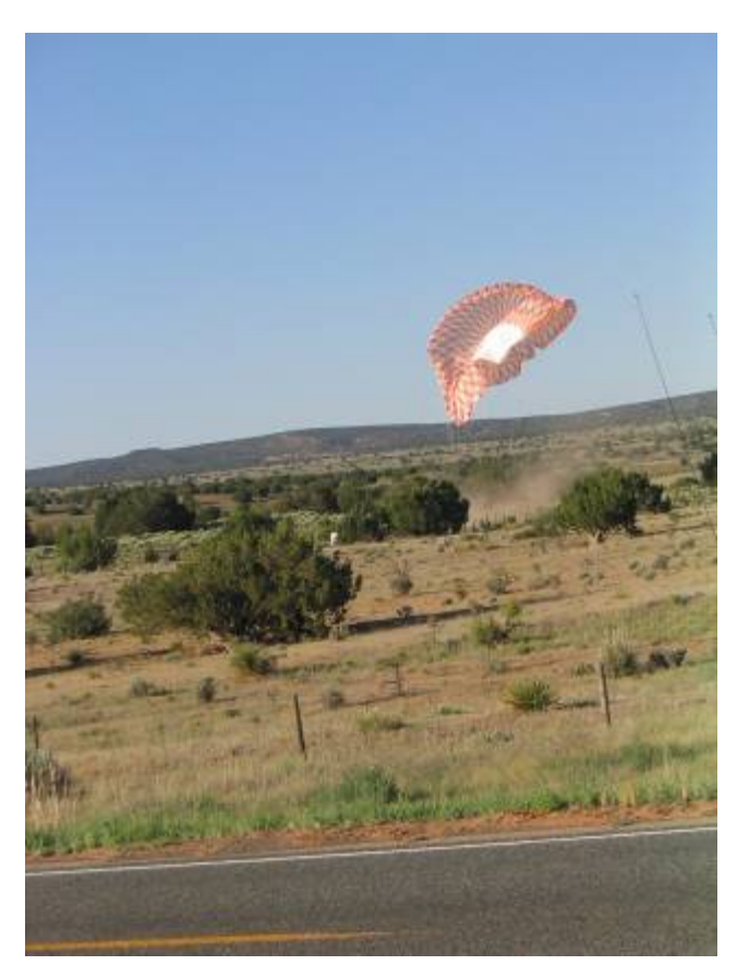
Figure 14 - Landing

Upon landing, the semi-automatic parachute release (SAPR) system is initiated, separating the parachute from the payload to prevent the parachute from dragging and damaging the payload.