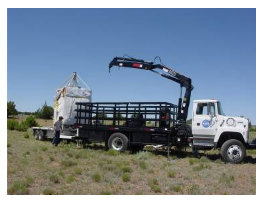
Figure 17 - Payload recovery