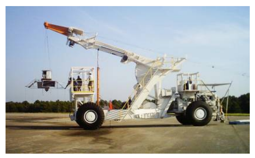
Figure 2 - Payload Suspended on Launch Pad

The mobile launch vehicle transports the payload from the staging area to the launch pad (Figure 2).