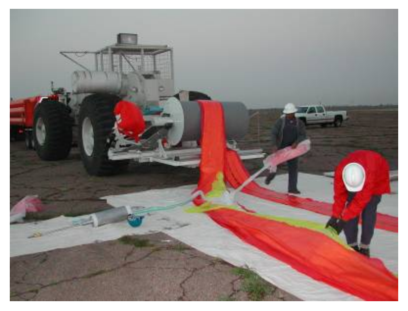
Figure 6 - Balloon bubble preparation on spool

After flight line checkout, the CSBF crew begins balloon inflation. The crew attaches helium valves to the balloon (Figure 6). Helium is pumped into the balloon until the precalculated amount has been delivered (Figure 7).