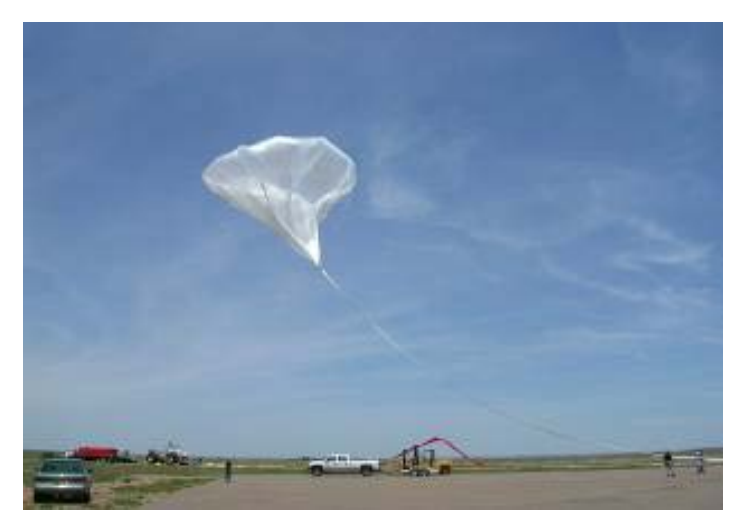
Figure 10 - Spool release

When the balloon is inflated with the proper amount of helium, it is released from the spool (Figure 10).