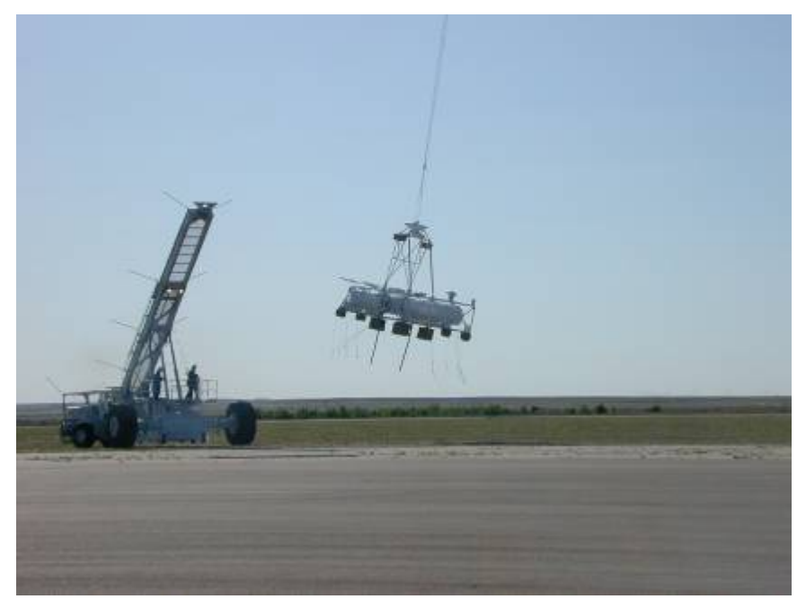
Figure 11 - Payload release from launch vehicle

As the balloon rises, the crew maneuvers the mobile launch vehicle with the payload until the balloon is almost perpendicular above the vehicle before releasing the payload (Figure 11).