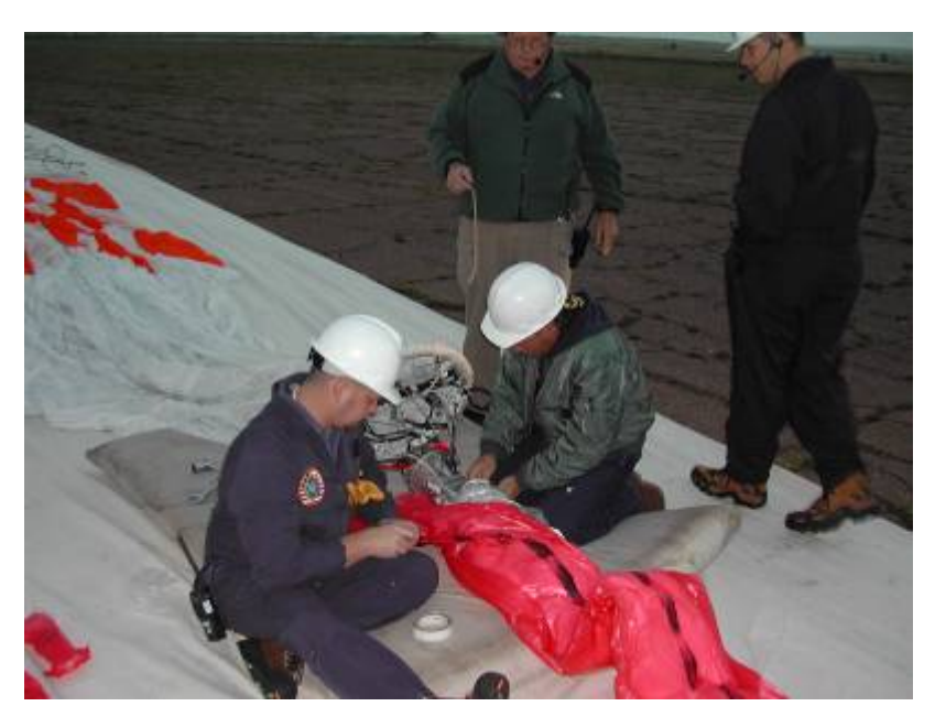
Figure 5 - Attaching the parachute