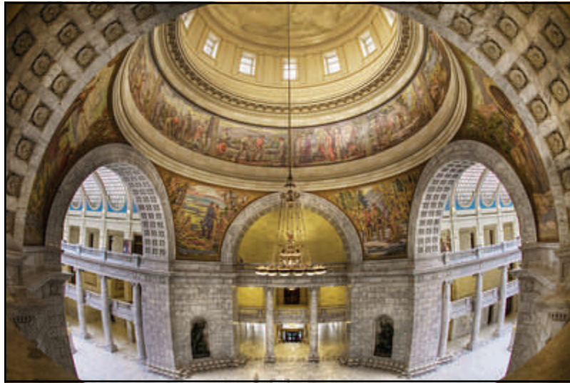
Utah State Capitol Building Rotunda