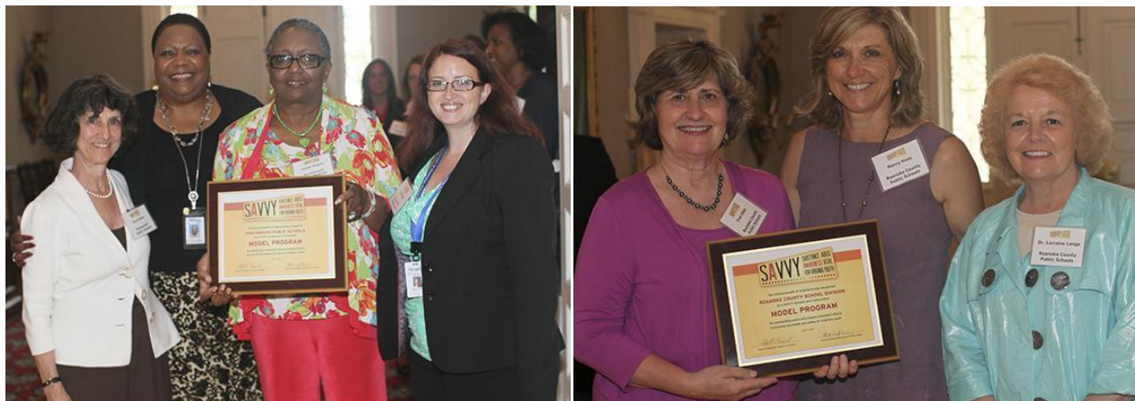
Model Program representatives from Portsmouth (left) and Roanoke County Public Schools