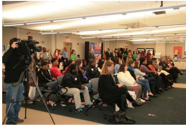
Media coverage and attendance at the Northern SAVVY Expo