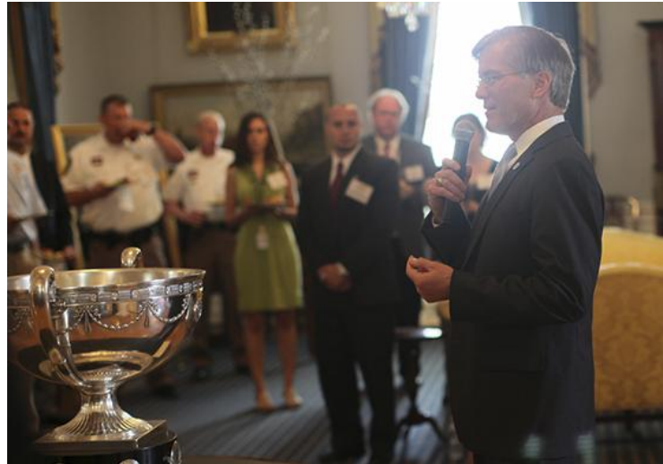
Governor McDonnell congratulated participants at the SAVVY Schools and Communities Recognition Program awards reception on June 3, 2013 at the Governor's mansion

Arlington Public Schools Newport News Public Schools Pittsylvania County Public Schools