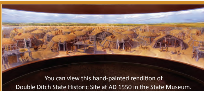
You can view this hand-painted rendition of Double Ditch State Historic Site at AD 1550 in the State Museum.

High on a bluff with stunning views of the Missouri River, Double Ditch Indian Village, home to perhaps 2,000 Mandan people at its founding, was a hub in a continental trade system. At about that time, Christopher Columbus reached the New World. Stroll the paths through the circular remains of earthlodges built from A.D. 1490 to 1785. Follow interpretive trails along the unique series of ditches, remains of defenses protecting a village.