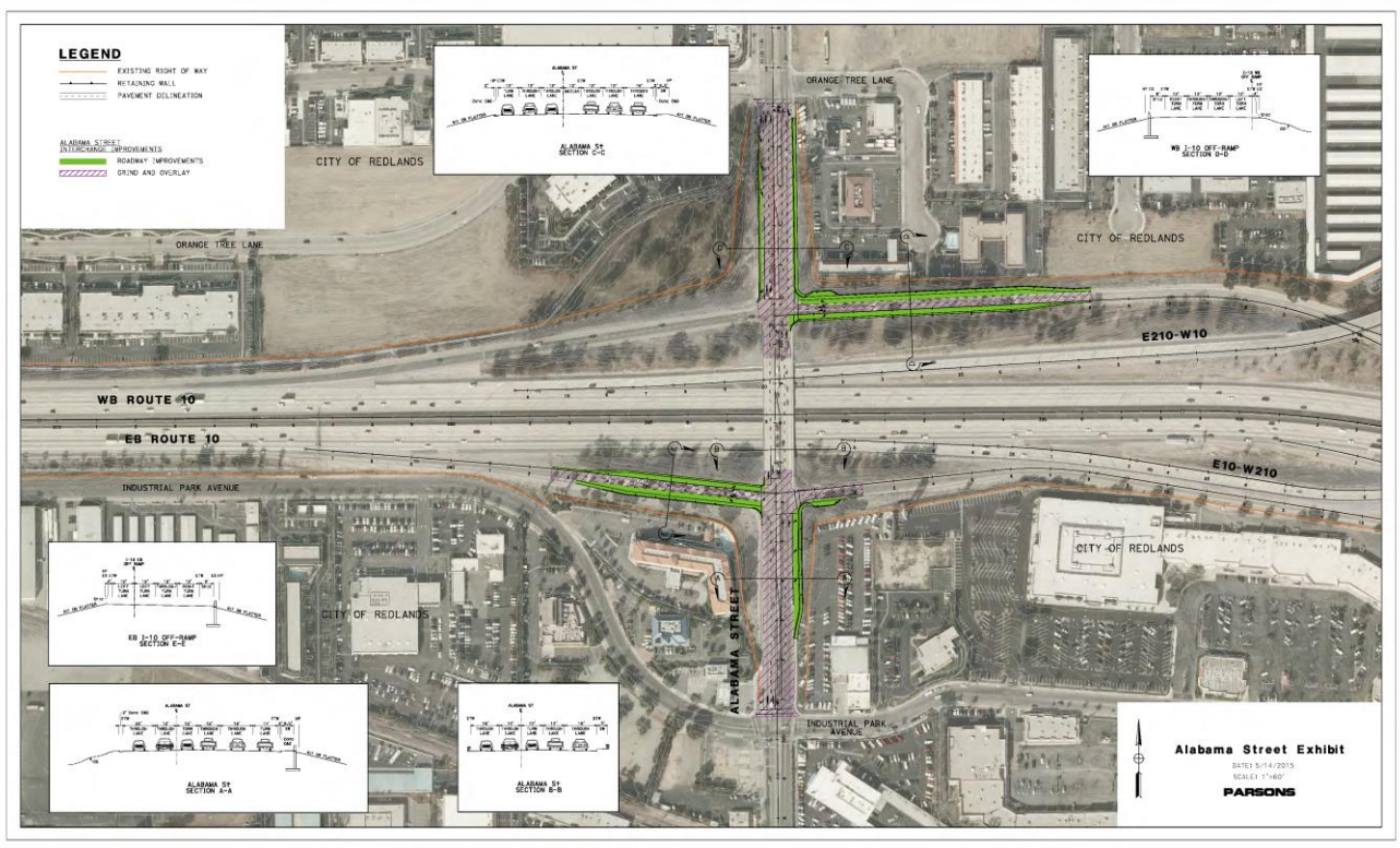
Figure A.1 Project Concept