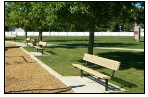
Parks & Open Space