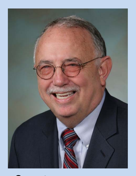
Senator Steve Conway 29<sup>th</sup> District