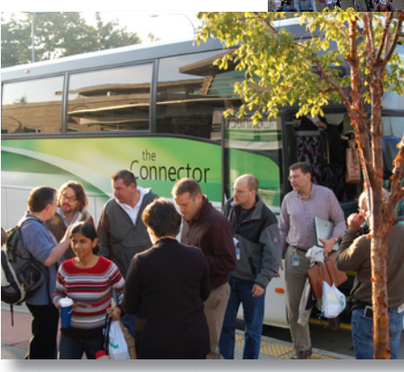
Employees departing The Connector, a private transit system offered free to Microsoft employees providing service from numerous neighborhoods direct to the Redmond Campus.

The Commission agrees that VMT reduction is a useful strategy to assist in reducing transportation greenhouse gas emissions, but as a goal in itself, we have concerns that it will disproportionately impact rural areas and certain types of workers. It also is difficult to persuade Americans to drive less - unless driving is more expensive. The obvious lesson of the past year is that the easiest and most effective way to reduce VMT would be to increase the gas tax by $.50 to $1.00 per gallon. Because such a