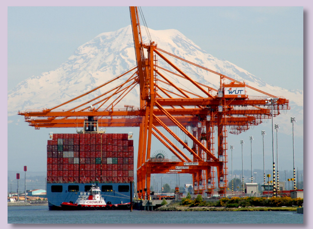
Washington United Terminal uses ultra-low sulfur diesel for all terminal operations at the Port of Tacoma.