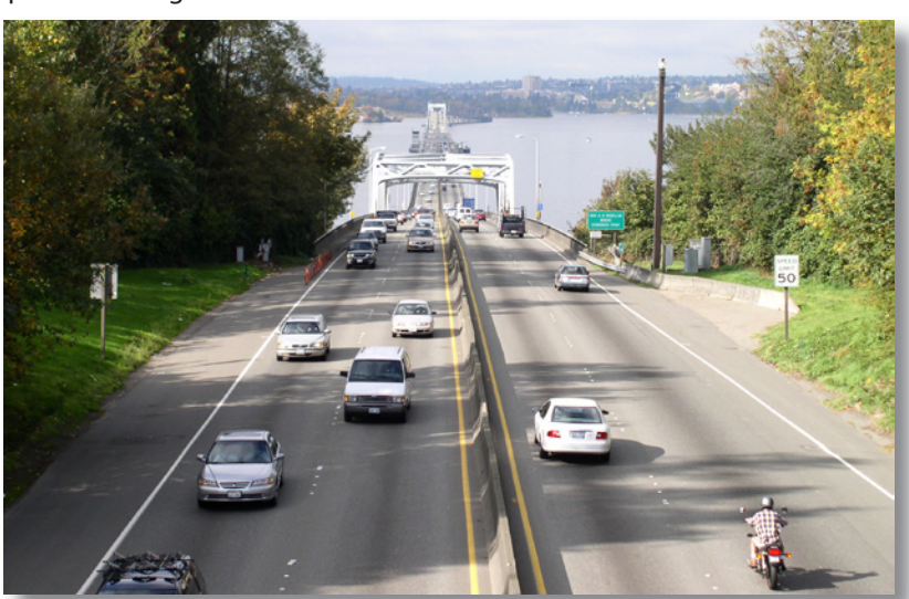
Toll revenue is essential to rebuilding and expanding SR 520.

gional Council (PSRC) evaluation of pricing strategies. Building on the Traffic Choices Study - an experiment involving over 275 households and over 400 vehicles using road use fees that differentiated between time of day and location using a GPS-based tolling system – PSRC is developing scenarios and using modeling to determine whether and how pricing can reduce traffic congestion and raise revenue for new investment.