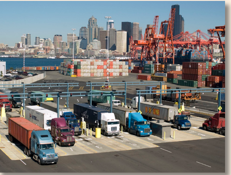
Port of Seattle intermodal operations are critical for international trade.

Transportation budget and policy decisions must continue to meet the needs of the entire state and its transportation network. Economic vitality and transportation are directly tied to one another, and therefore must remain a high priority in all transportation policy and funding deliberations and decisions. Economic vitality should be included in statute as a priority goal for planning and funding transportation investments statewide.