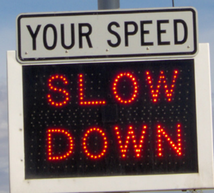
"Slow Down" warning sign on a rural Kittitas County road.

Another short line, the Washington and Idaho Railway Company, operating the P&L Line in the Whitman County portion of the Palouse and Coulee City Railroad since June 2007, succeeds in part because its three employees run the engines, repair track, keep accounts and everything else. This short line railroad plays a key role in moving grain to markets and getting fertilizer to farms. The P&L line collaborated successfully