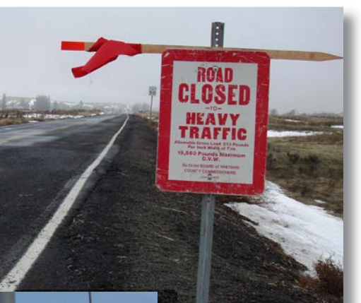
Posted weight load restriction in Whitman County.