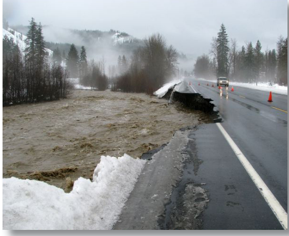
January 10: SR 97 – Blewett Pass.

The 2009-2011 state transportation revenue forecast declined by 2% from the February 2008 forecast to the November forecast. At the same time, prices for steel and concrete rocketed, and oil prices have been volatile. As a consequence, when demand and price for refined oil products rose, more