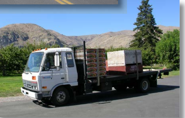
Fruit growers depend on reliable roads and intermodal connections.

Busy, winding rural roads are the least safe.