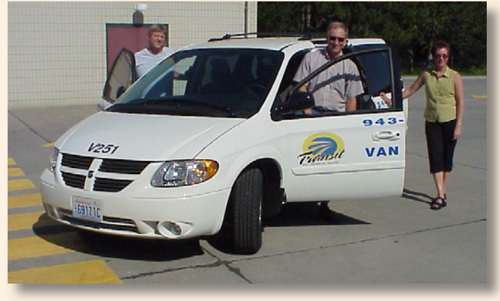
Vanpool opportunities are in demand in the Tri-Cities and across the state