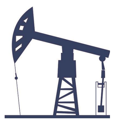
No Fuel Surcharges