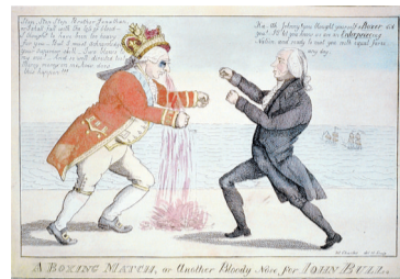
Cartoonists lampooned initial British efforts in the War of 1812. But the tide soon turned against the American invasion of Canada and its lax defense of the Chesapeake Bay.

division's responsibility and its availability to consult with F-22 bases in our Medical Response Plan," Sholtis said.