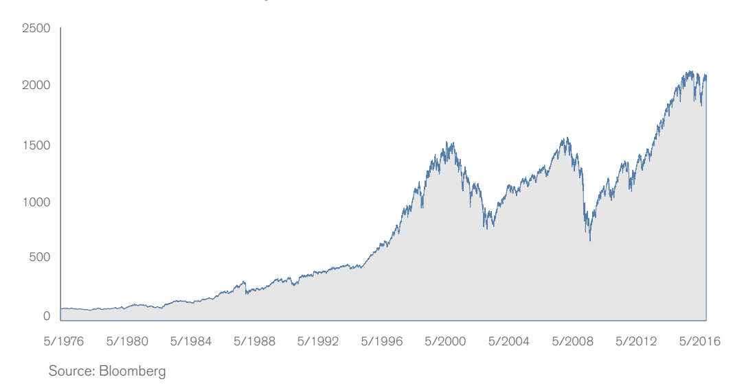
Chart 2: S&P 500 Index - Dividend Adjusted Value

Let me borrow some excellent work from another investment firm that has occupied the upper floors of the market's grand hotel for many years now. GMO's Ben Inker in his first quarter 2016 client letter makes the point that while it is obvious that a 10-year Treasury at 1.85% held for 10 years will return pretty close to 1.85%, it is not widely observed that the